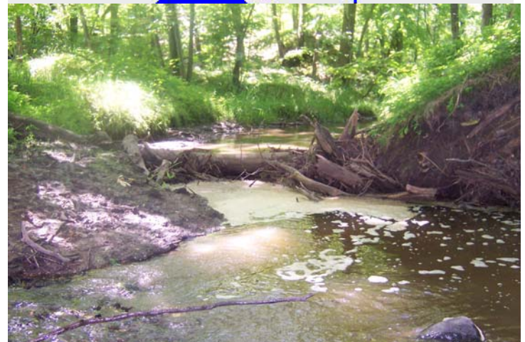
Erosion sites in Campbell Creek.