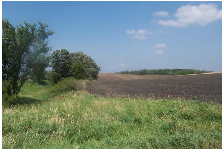
Nutrients and fine sediments in Campbell Creek seem to be associated with field runoff.