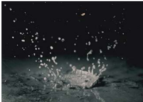
This vividly illustrates the explosive effect of a raindrop hitting unvegetated soil.

Minnesota's shorelines are being urbanized at a record pace. Structures and turf grass lawns replace natural shores and have adverse impacts on water quality and the diverse life that depends on a natural shore. A natural shoreline is more than an aesthetic buffer for the water; it is a complex ecosystem that provides habitat for fish and wildlife and protects water quality for the entire lake.